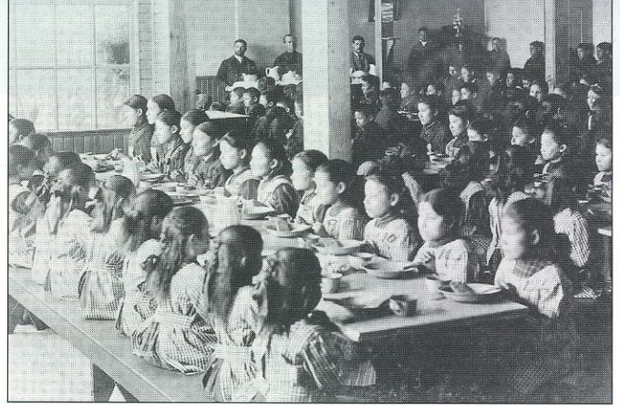
Figure 17-2 This photo of a dining room in a residential school reflects the strict supervision and table manners. Boys and girls were separated.

Residential schools have had a devastating long-term effect on Aboriginal people and their communities. The schools broke the connection between children and their parents and culture. Many children, unable to reconnect to their family and culture after the enforced isolation and anti-Aboriginal instruction, rejected their past. Others suffered from the effects of physical, sexual, and psychological